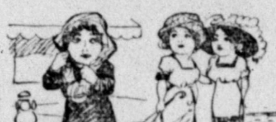
What Two Vanity Fair Girls Saw in the Ghetto.

And by way of a first lesson one must be born there.