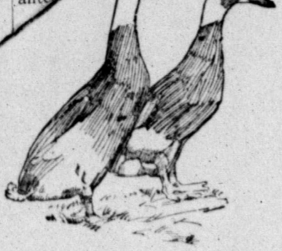
Indian Runner Drake and Duck.