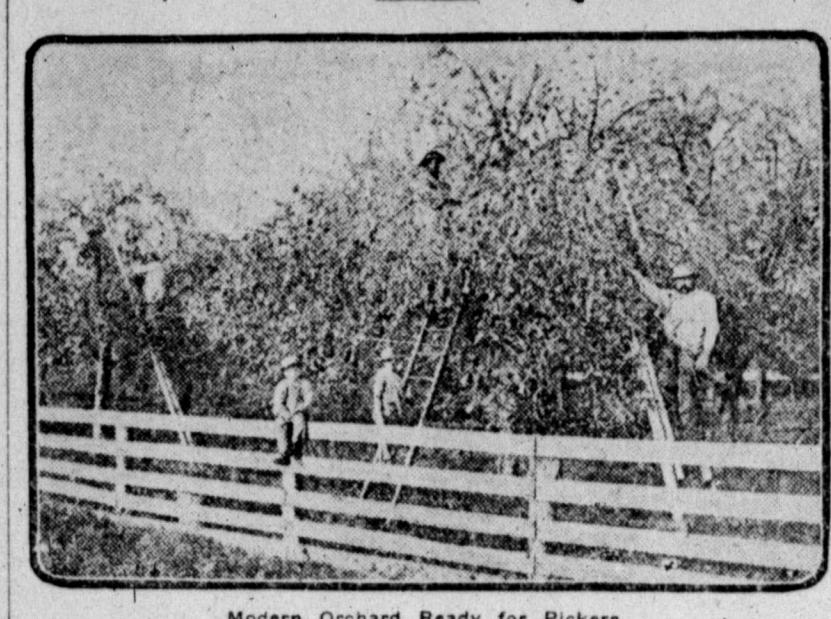
Modern Orchard Ready for Pickers

Common Method Is to Mark Off Rows and Use Two-Horse Plow to Open Up Furrows-Bright Piece of Wire Affords Handy Means of Marking-Notched Board Is Useful.