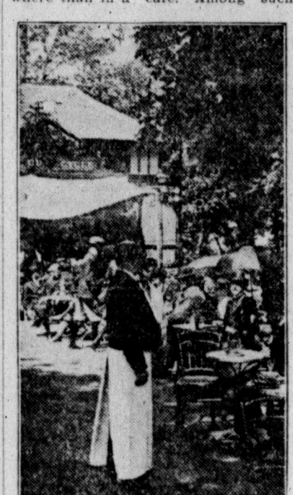
Parisian Boulevard Cafe.

Both might have added that certain beverages have a peculiar way of losing their flavor when consumed elsewhere than in a cafe. Among such