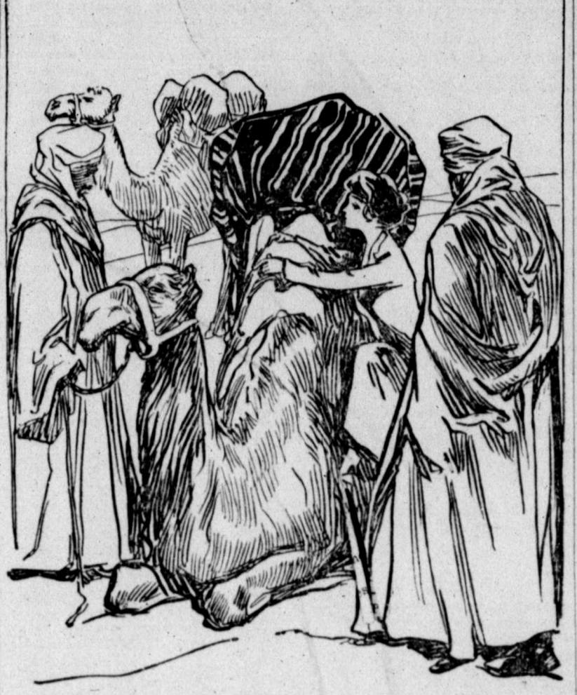
Saw Fortune, Unresisting, Placed Upon the Camel, Under Canopy.