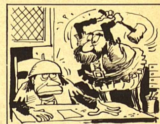
THEN: In the Middle Ages, using anesthesia meant that the surgeon put a bowl on the patient's head and beat it until he was unconscious.