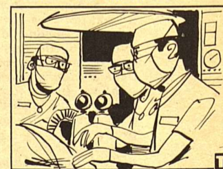
NOW: A team of doctors and nurses administer anesthetic drugs and insure the safety of the patient. Thanks to Sodasorb, a specialty chemical substance produced by W.R. Grace & Co., the patient's exhaled carbon dioxide is absorbed in rebreathing systems. Today, happily, when someone is "knocked out" for surgery, it doesn't mean from blows on the head.