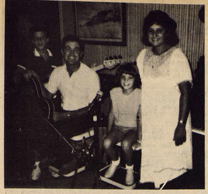
TANKERSLEY FAMILY SINGERS