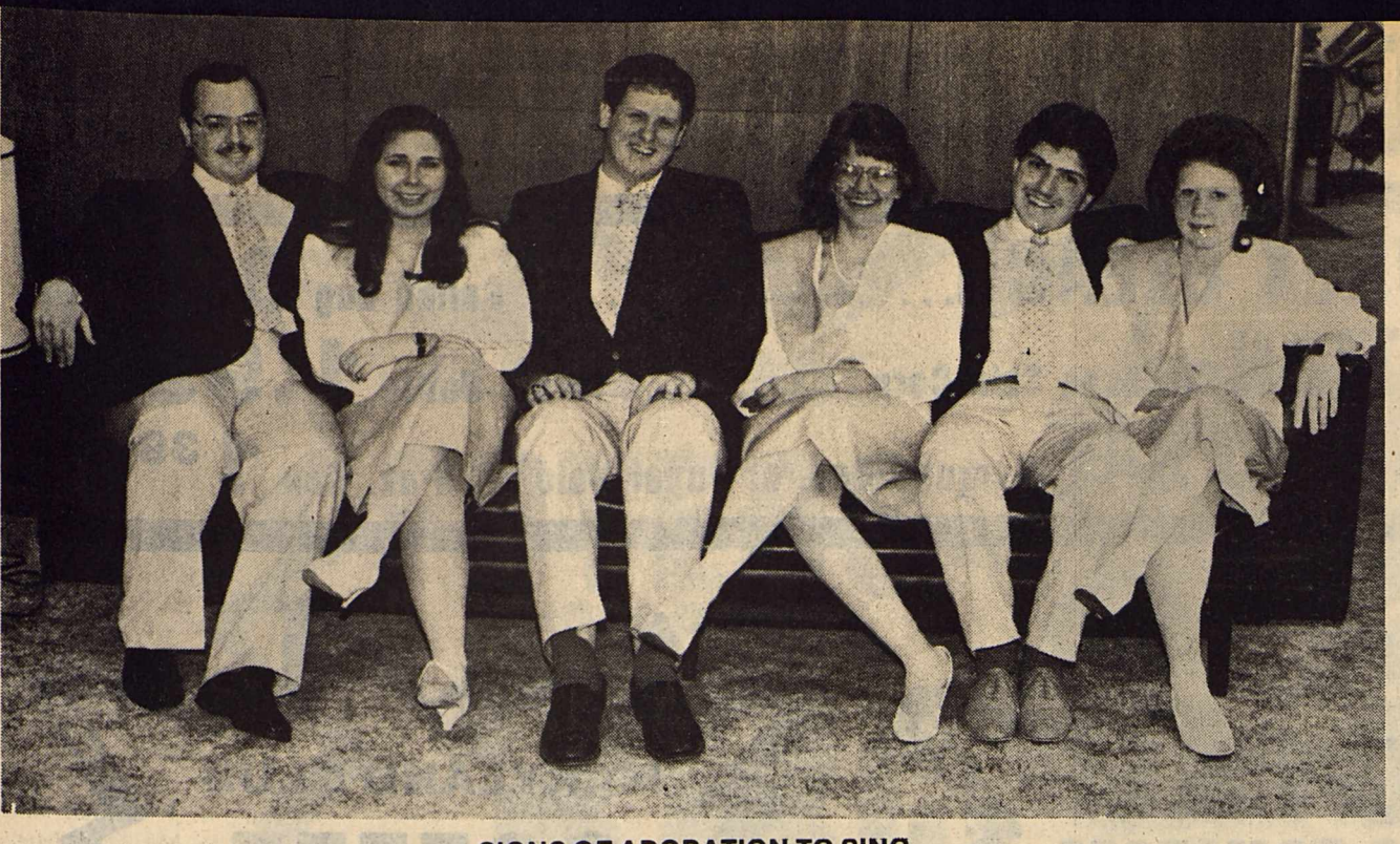
SIGNS OF ADORATION TO SING