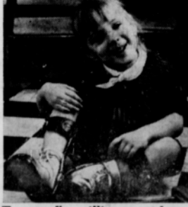
Try me-I'm willing to get better