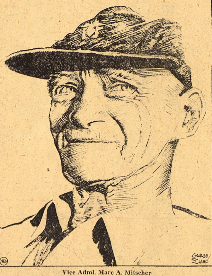
Slight, gaunt, leather-faced Vice Admiral Marc Andrew ("Pete") Mitscher, above, is the sprightly spark plug of the mighty Task Force 58...