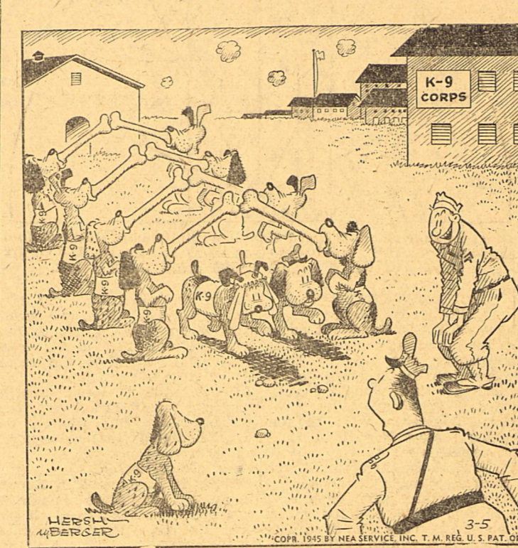
"It's a military wedding!"