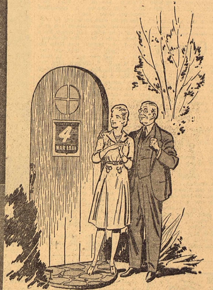
Every patriotic home in America will want to display this emblem. Paste it on your front door or on a window to show that you have done your part in the 4th War Loan.