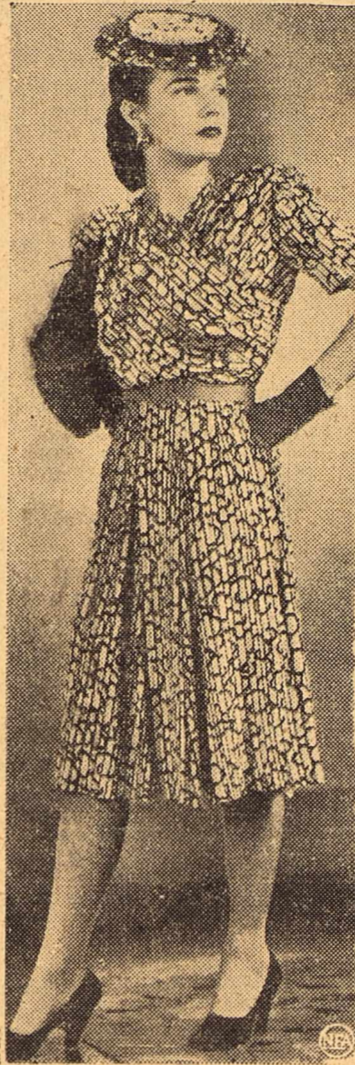
The skirt and bodice of this print dress look as though they were accordion pleated...