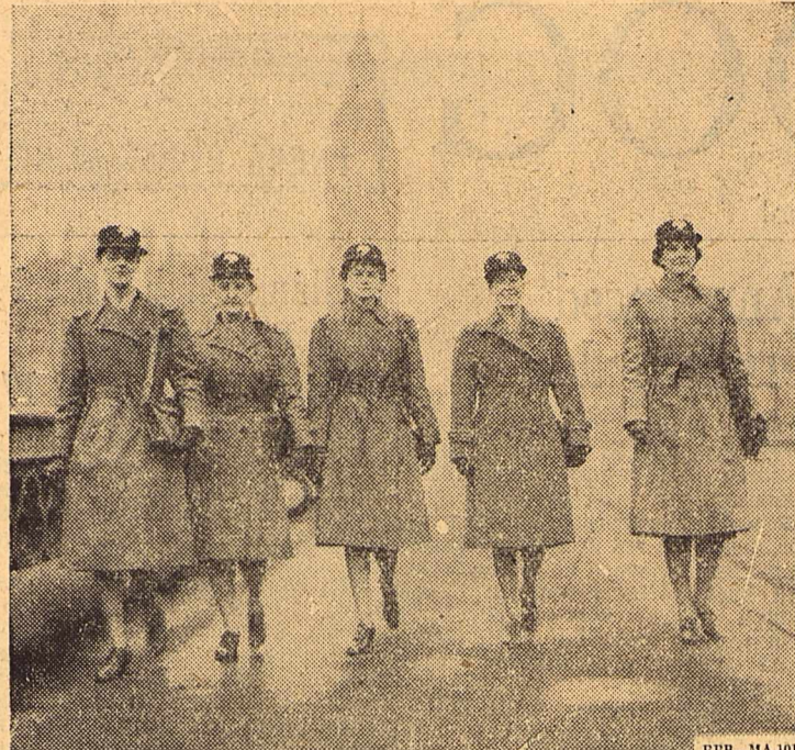
It wouldn't be London without a touch of fog, the chimes of Big Ben, and, today, the uniformed soldiers of half the nations of the world. Members of America's Women's Army Corps, down here walking over famous Westminster Bridge, are a popular addition to the London scene.