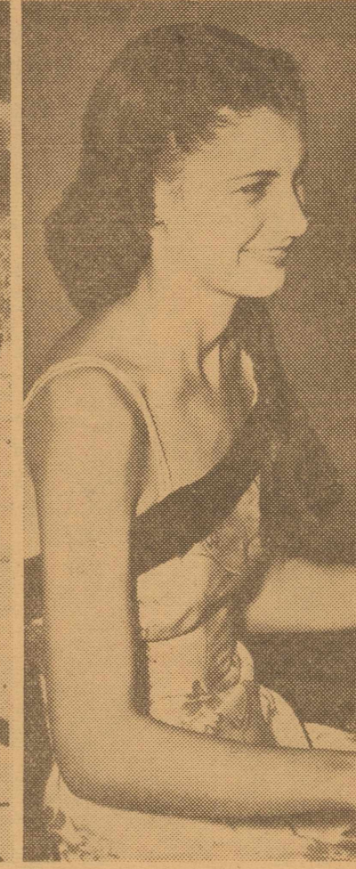
high school here. She was chosen most popular girl in 1937 and was editor-in-chief of the Catoico, high school annual, the same year. She appeared as Princess of Mexi-