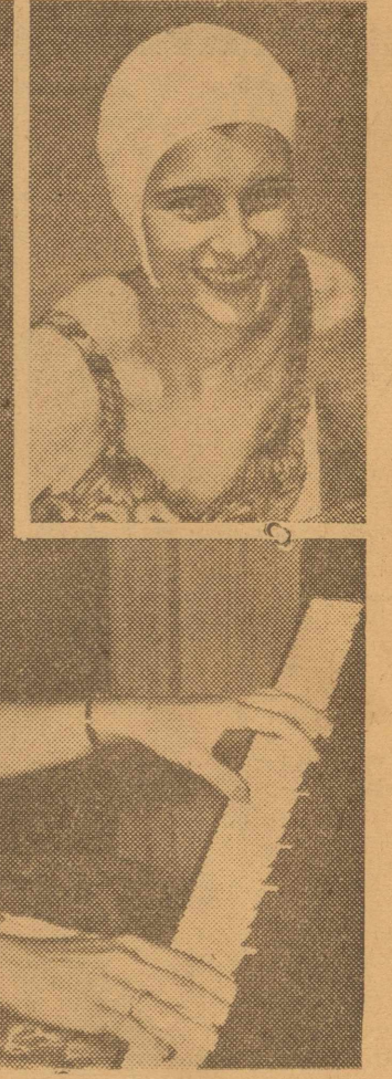
co in the 1937 Queen's coronation and was a candidate for annual queen in 1938. She took part in the junior play and was a member of the choral club and girls' quartet, a pep squad leader, secretary of the literary society, president of the home economics club, and a member of the staff of the High School News.