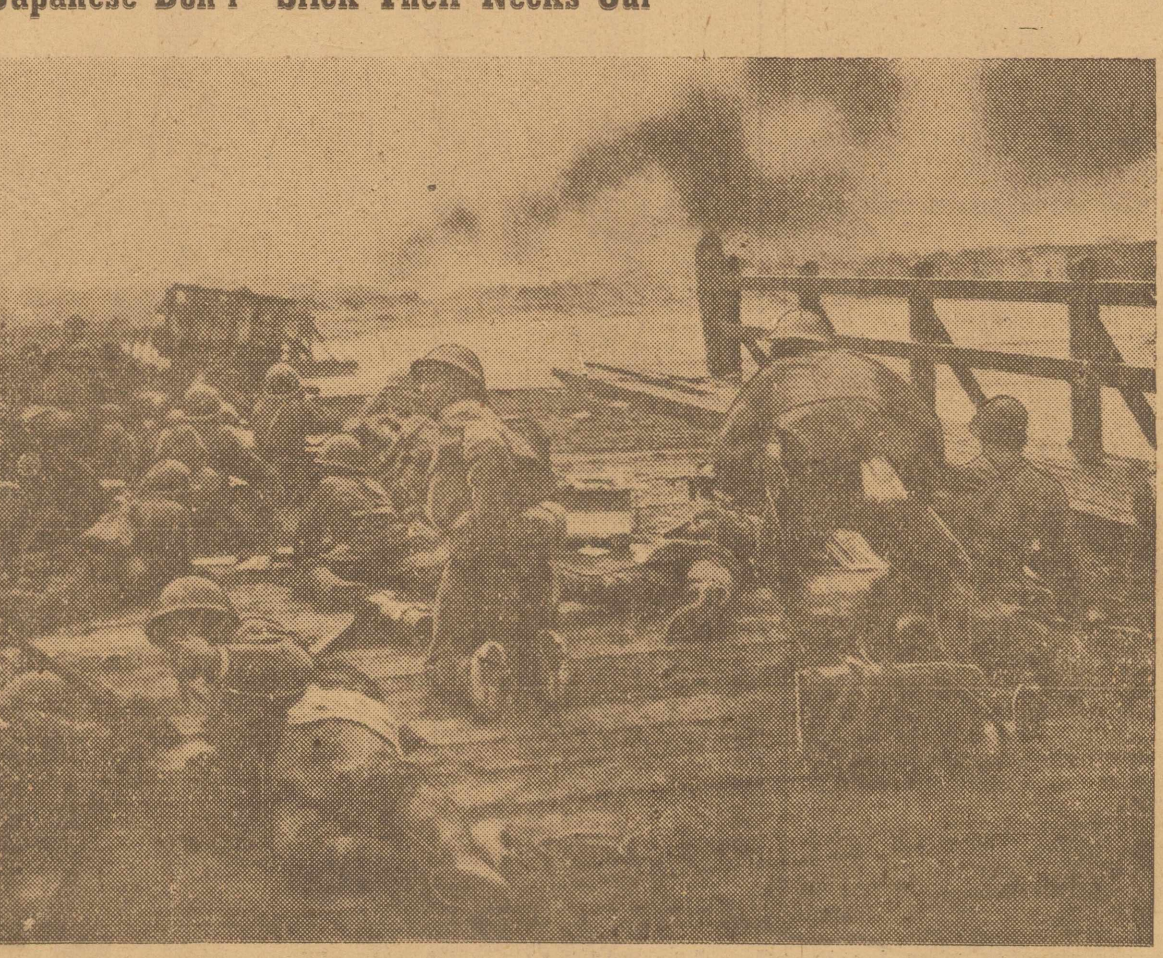
Japan has not yet declared war on China, but to her soldiers the "incident" in China is war aplenty This dramatic photo shows Nipponese assault troops sticking mighty close to the planks of a wrecked bridge as they wait for the signal to advance. It was taken as they prepared to attack a strategic point near Ponyang Lake.