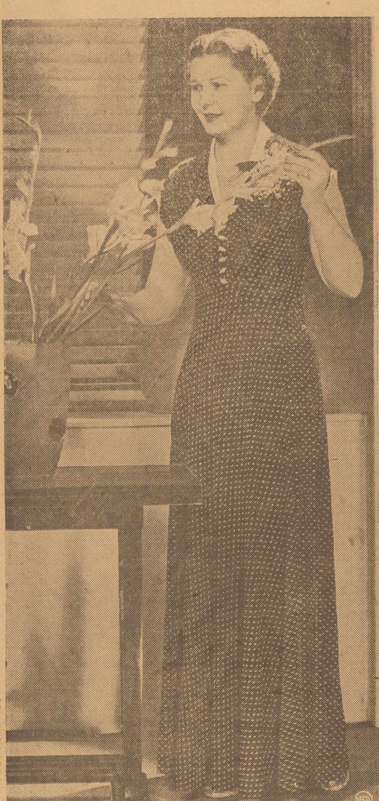
Perfect for any mature figure is this charming summer dinner dress of silk jersey in navy blue with white polka dots, worn by Bess Johnson, dramatic star of radio.