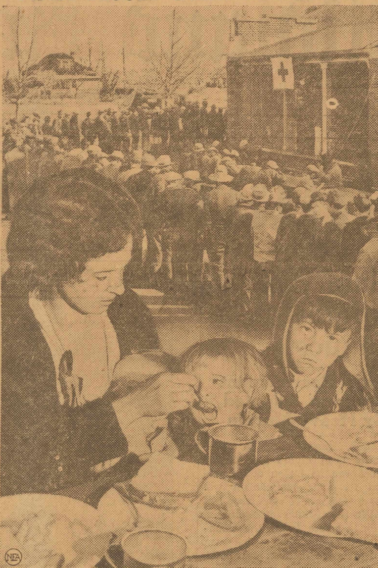
Suffering from floods only slackens, does not cease, when the water begins to recede, California relief officials are learning as they strive with meager resources to feed thousands of refugees...