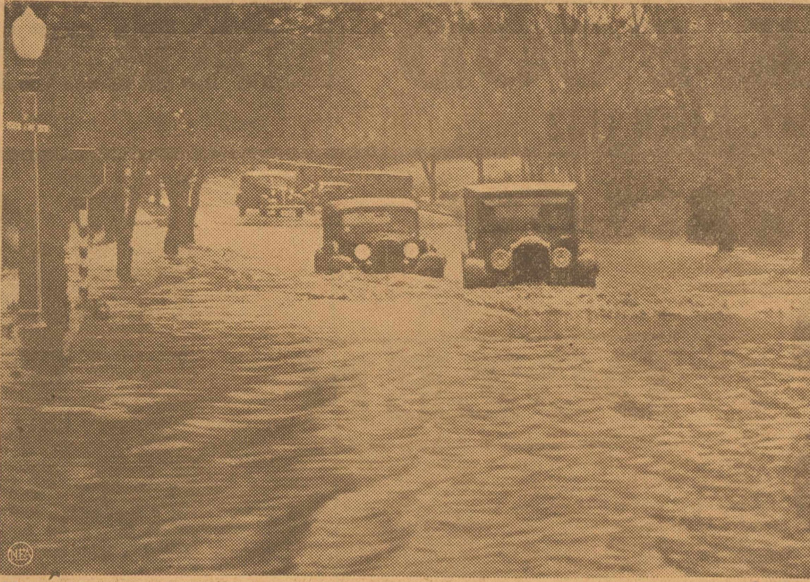
The season's heaviest rainstorm made rivers of Los Angeles streets and thousands of autos were stalled trying to push through swirling water such as is pictured above.