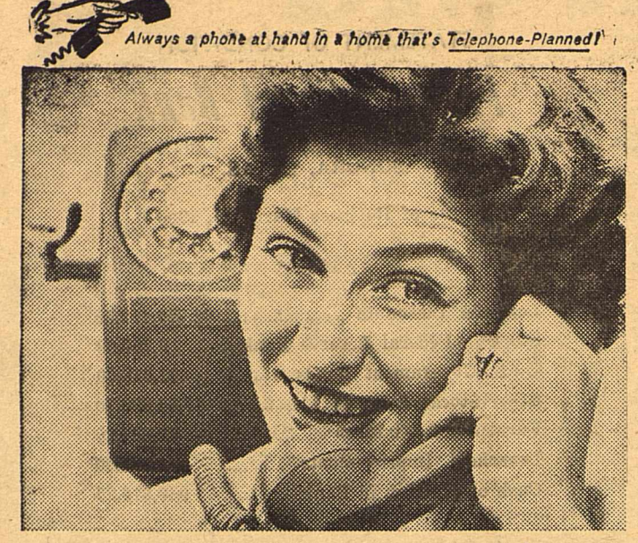
"... but I am watching my pie!"

Kitchen phones have become a "must" in the modern home. Think of the time, steps and annoyance you'd save with one! And they cost so little. Get a spacesaving wall phone, in the color of your choice!