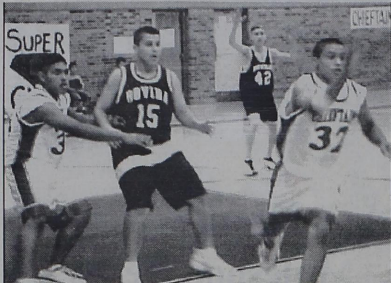
THE BOVINA JV boys beat the Friona JV in the Friona JV tournament held in December.