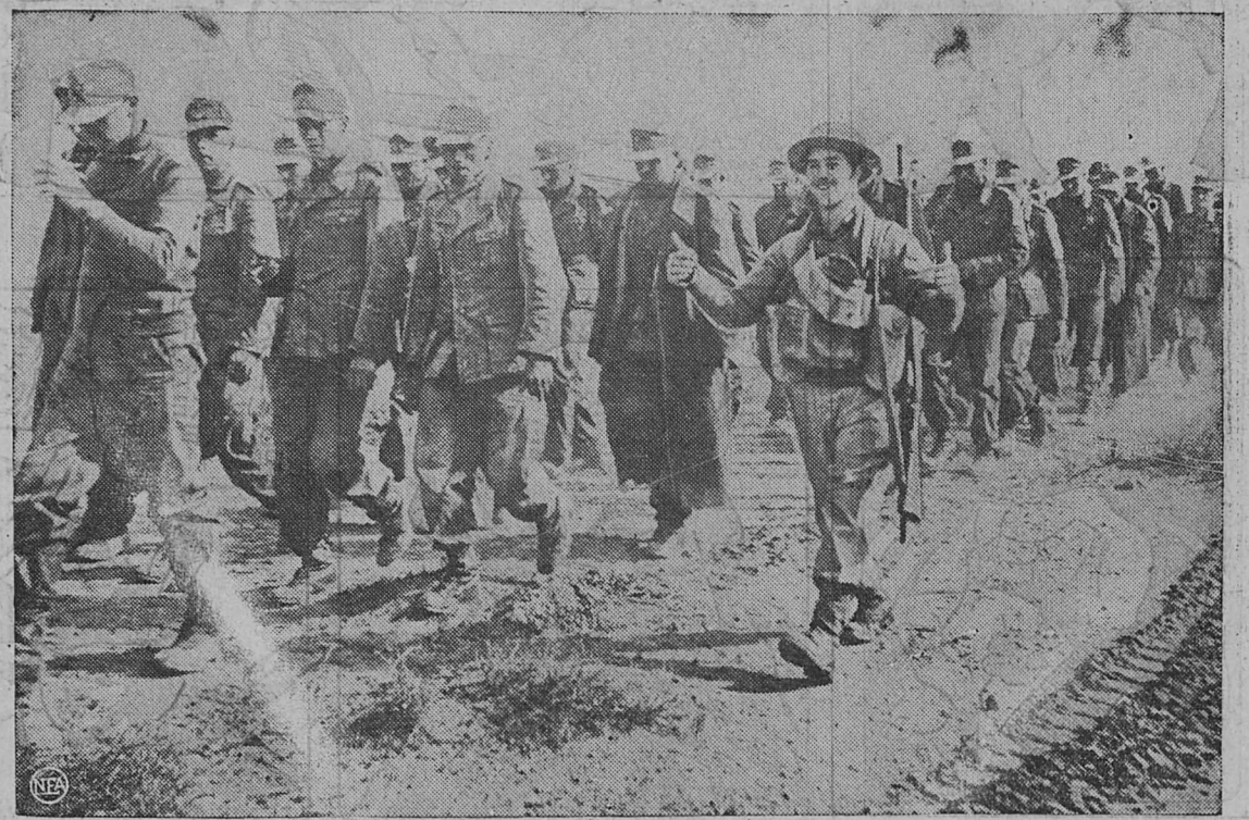
Lone Britisher goes about pleasant task of escorting a batch of sullen axis prisoners to interment Tobruk. This scene has been repeated many times in smashing British victory across Libya.