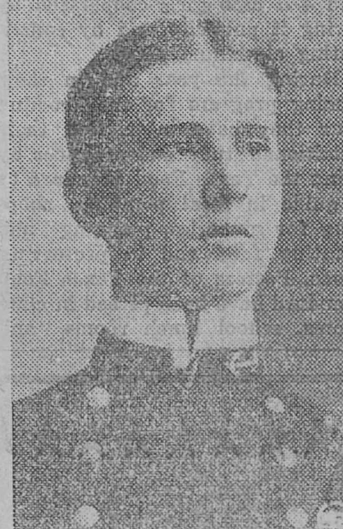
King as Annapolis middle.