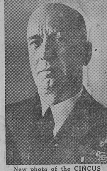
New photo of the CINCUS New and old pictures show Admiral Ernest J. King, commanderin-chief of the United States fleet.