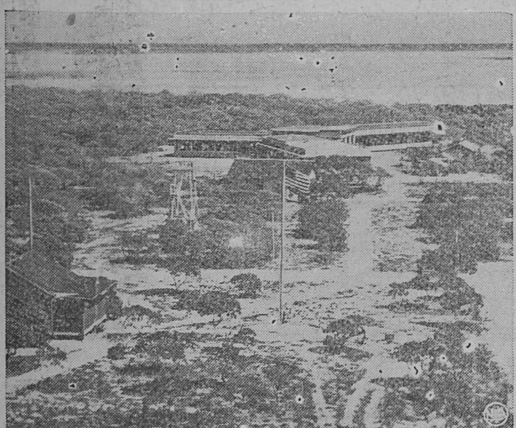
This is a scene on tiny Wake Island, where the U. S. Marines gave the Japs a good going over, knocking off landing attempts and sinking a cruiser and a destroyer. Buy defense bonds and help those leathernecks do it again.