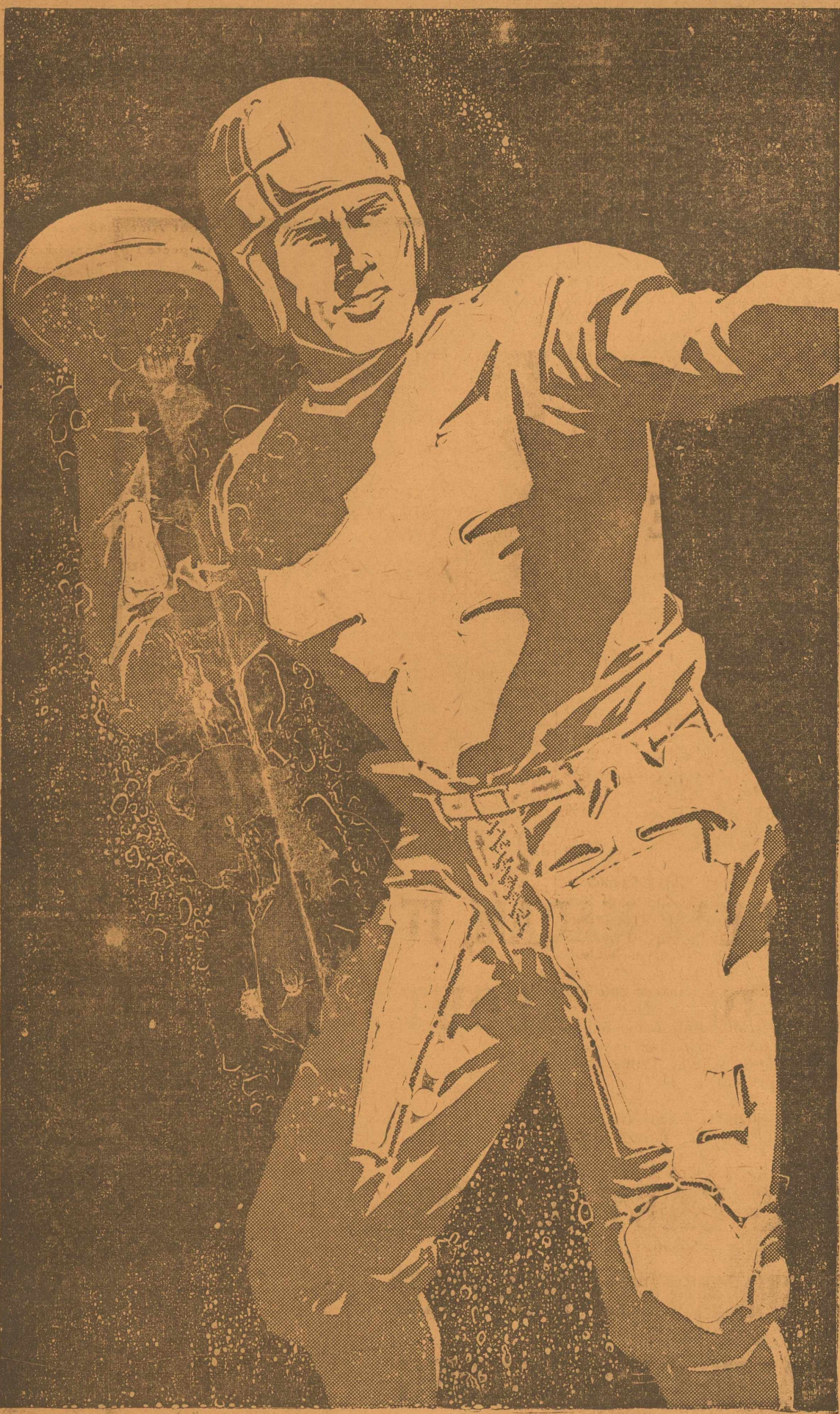
STARTING LINE-UP OF BOTH TEAMS