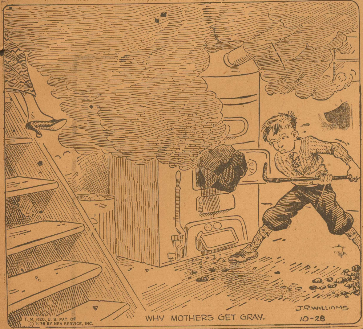
WHY MOTHERS GET GRAY.