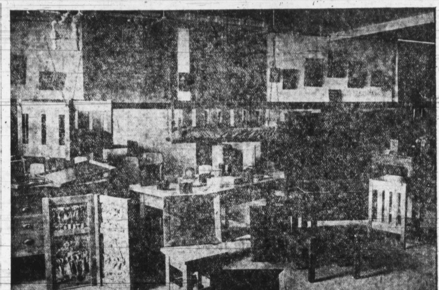
WOODWORKING AT THE COLLEGE OF INDUSTRIAL ARTS

functions, and in putting in order every part of the female It lessens the pains and burerfect order every It's an invigorating, restorative toni soothing and bracing pervine.