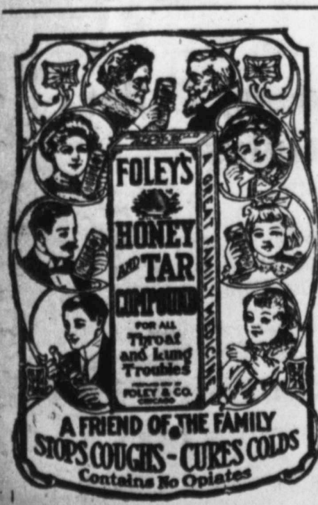
Swift Bros. & Smith

Most of the merchants today retused to consider the warnings seriously and continued buying such cotton as was offered at the prevailing prices. Several similar notices were posted at gins near