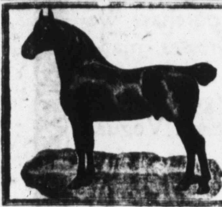
MEINHARD Registor No. 5367

Successor to Clark Bros. Give us a trial. A part of your business will be appreciated as well as all. Any flavor. Write, wire or Phone 50