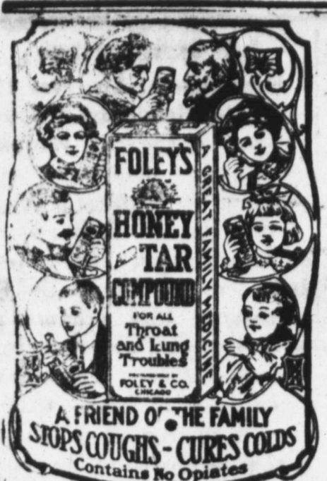
Sold by Swift Bros & Smith

"They tell me the Grouch beat his wife up this morning," said the Cheerful Idiot. "Is that so?" asked the Boob.