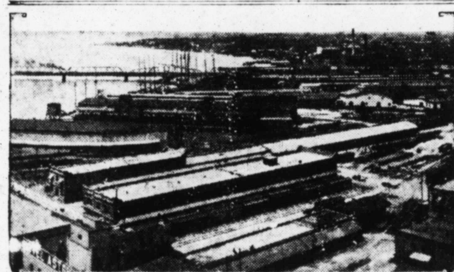
SECTION OF JACKSONVILLE'S WATER FRONT

Jacksonville, Fla., March .- Visitors to the Confederate reunion in Jacksonville, May 6-8 inclusive, will have an opportunity to see one of the largest alligator farms in the country. The Florida alligator farm is located at Phoenix park, connected with the city by trolley lines, and is a popular place with all visitors. The illustration here shown is a pen of the largest alligators in the collection of some 3,000. The oldest alligator in captivity is owned by this farm. The specimen is about 250 years old and weighs 921 pounds.