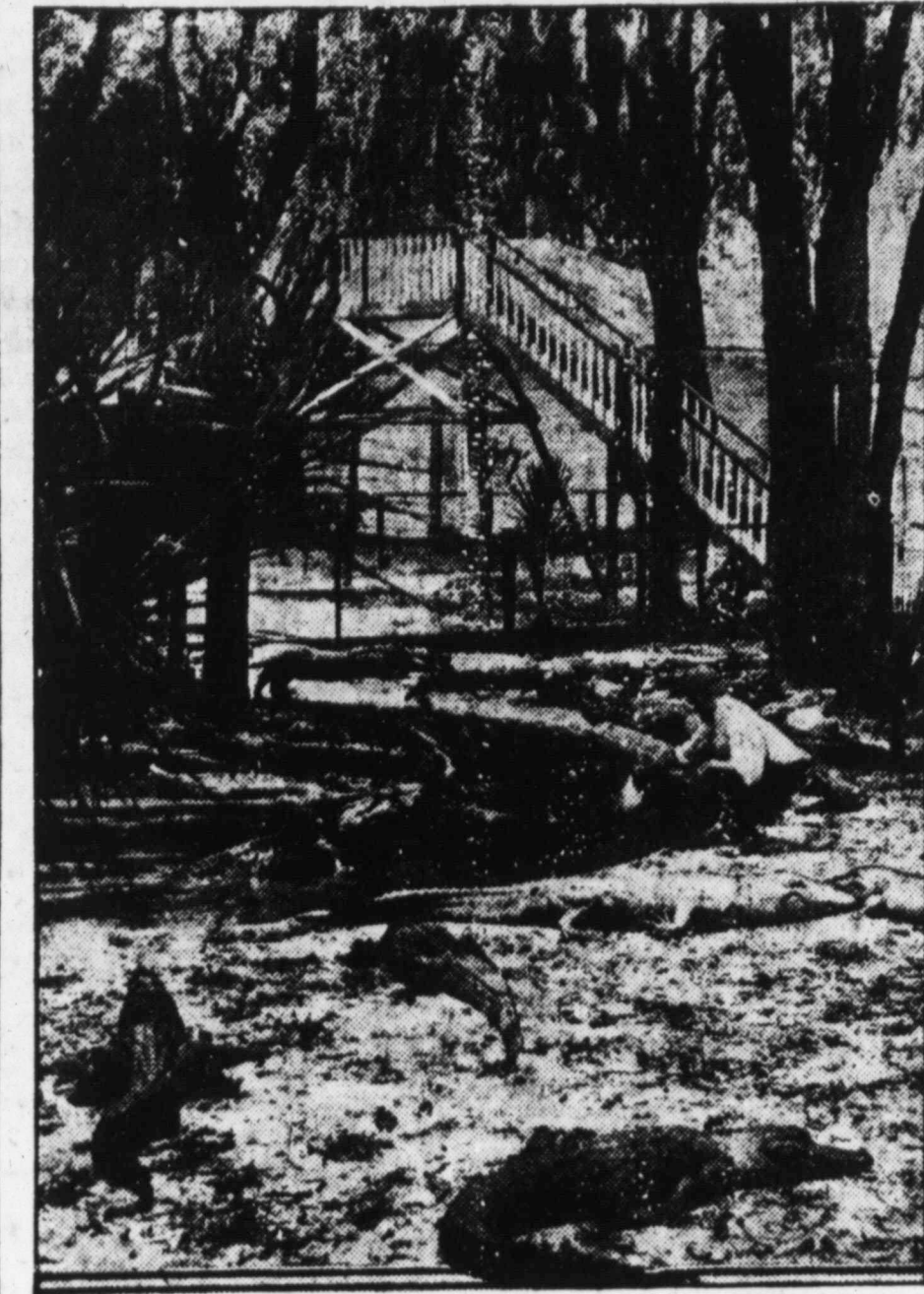
A FLORIDA ALLIGATOR FARM

Some call it tainted money because 'taint coming their way.—Snap Shots.