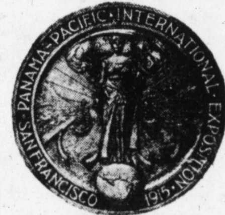
THE OFFICIAL EMBLEM OF THE PANAMA-PACIFIC INTERNATIONAL EXPOSITION, SAN FRANCISCO, 1915.

The tallest structure at Harbor View, the Exposition site, will be 425 feet. Around this will be grouped huge domes, minarets and towers, which from a distance of four or five miles