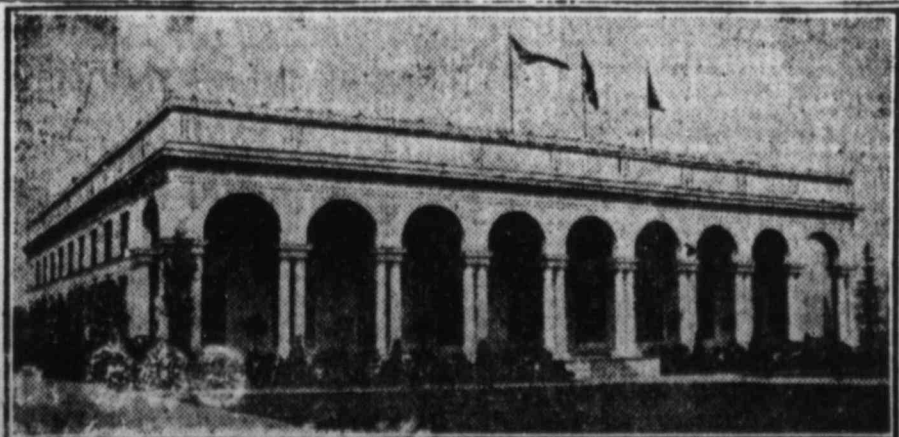
SERVICE BUILDING, FIRST OF THE COMPLETED STRUCTURES.