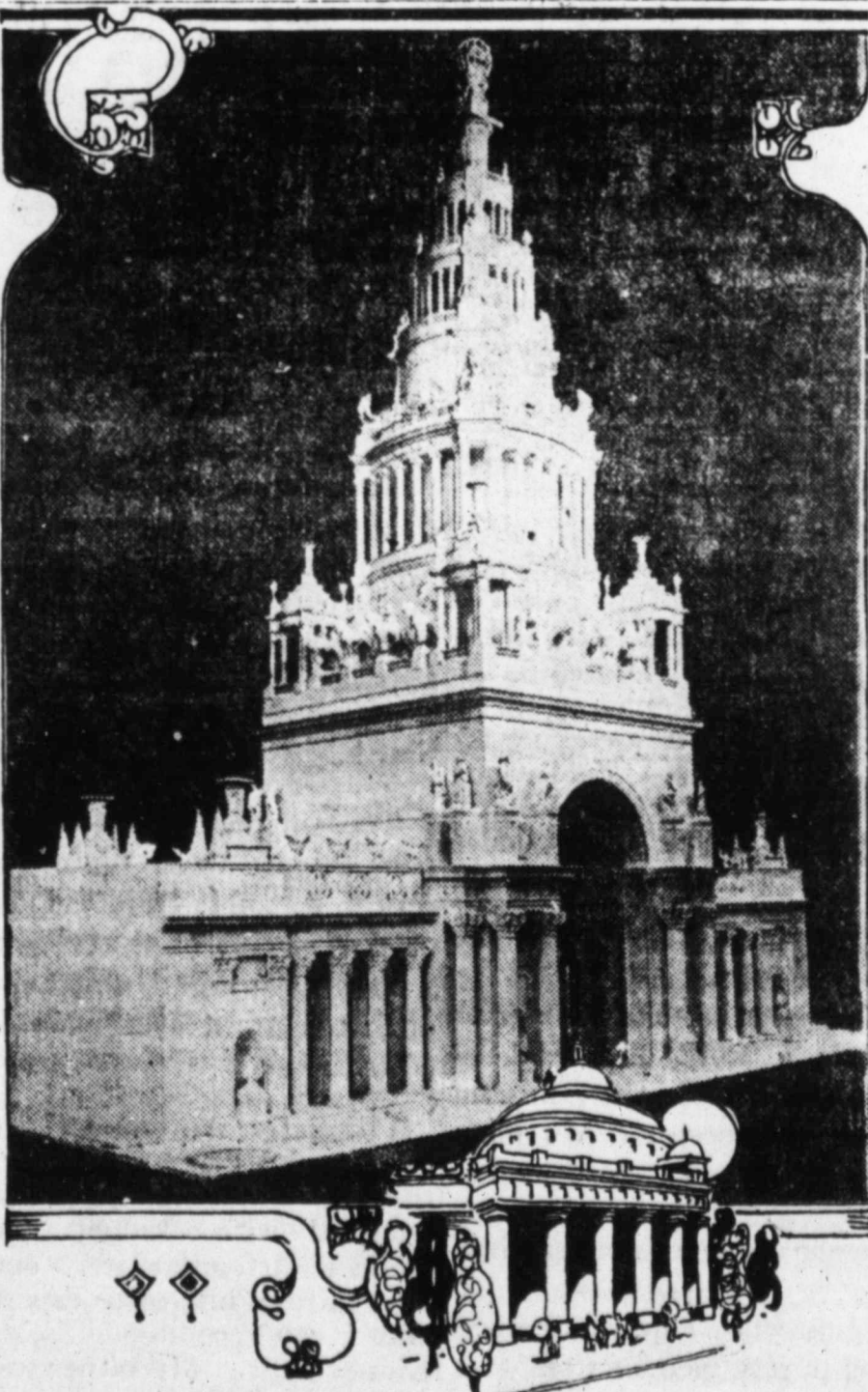
THE HUGE TOWER OF JEWELS, 430 FEET HIGH.

Every state in the United States will be represented at the Exposition. In most of the states the legislatures have made direct appropriations for participation. In the few that have not done so commercial interests are co-operating to raise large sums in order to have their states represented. This is being done in Iowa, Oklahoma and other commonwealths which feel that as they bore a part of the expense of building the Panama canal their citizens should participate in the Exposition that is to celebrate the canal's completion.