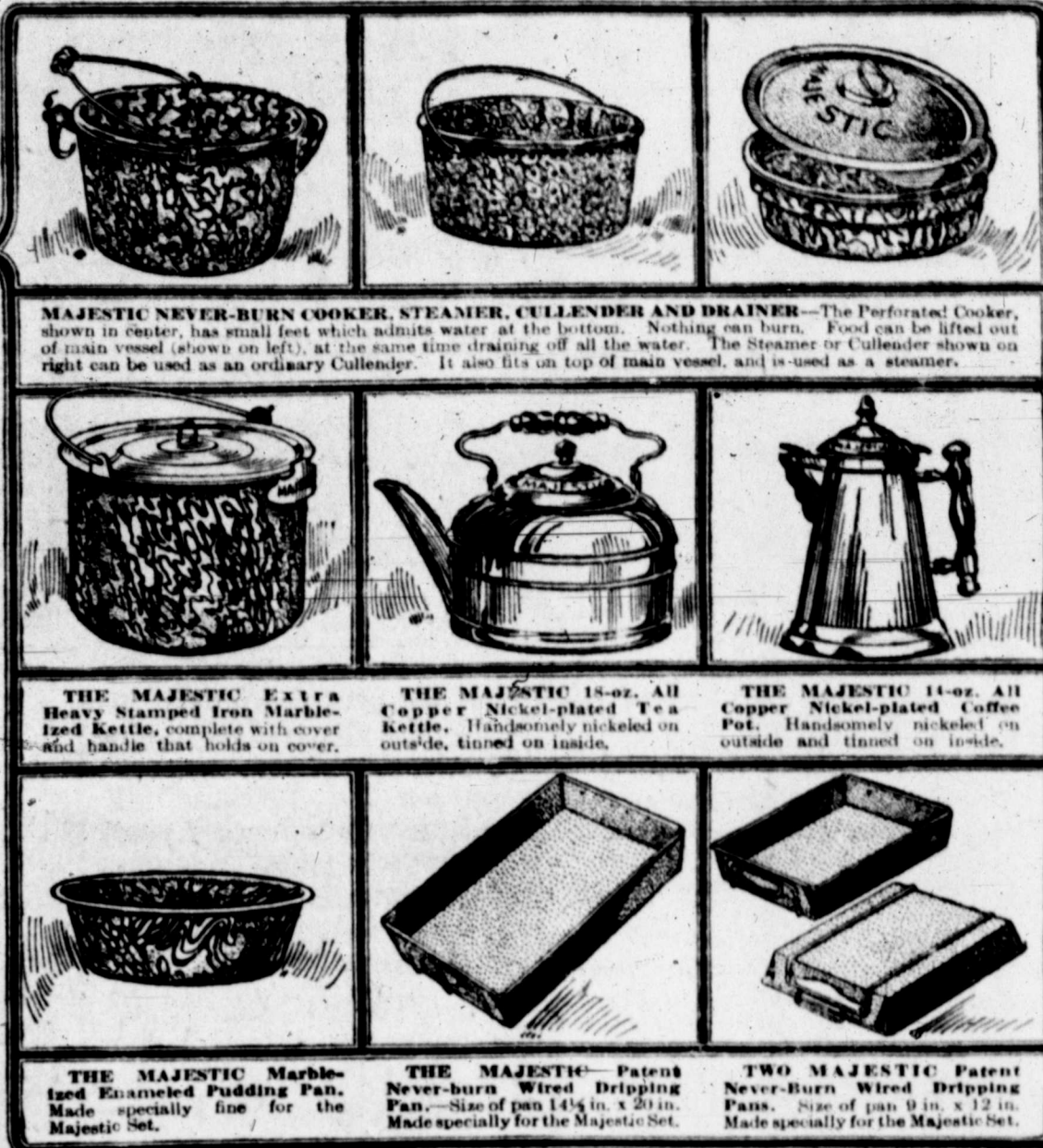
MAJESTIC NEVER-BURN COOKER, STEAMER, CULLENDER AND DRAINER —The Perforated Cooker, shown in center, has small feet which admit water at the bottom. Nothing can burn. Food can be lifted out of main vessel (shown on left) at the same time draining off all the water. The Steamer or Cullender shown on right can be used as an ordinary Cullender. It also fits on top of main vessel, and is used as a steamer.

THE GREAT AND GRAND MAJESTIC RANGE THE RANGE WITH A REPUTATION MADE IN ALL SIZES AND STYLES.