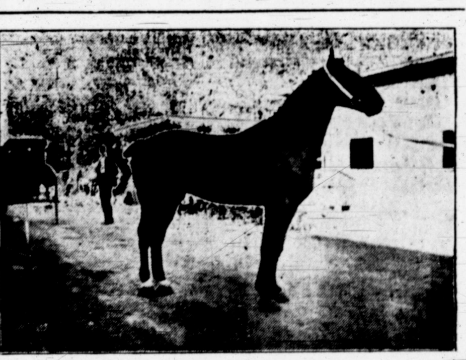
FELDLINTER NO. 3983 German Coach Stallion owned by Nacogdoches Stock Improvement Company

country than all other diseases put loyether, and until the last few years was supposed to be incurable. For a great many years doctors pronounced it a local disease and prescribed lo-