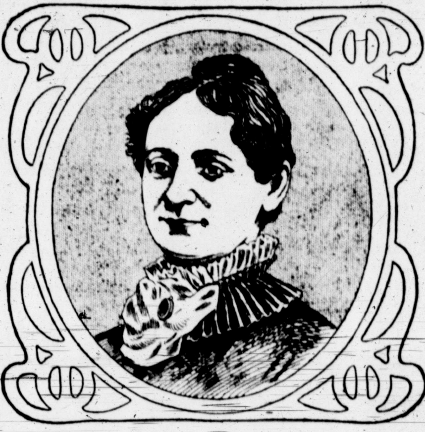
LYDIA E. PINKHAM

Of Lydia E. Pinkham's Vegetable Compound, the Great Woman's Remedy for Woman's Ills.