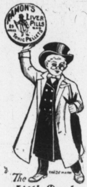
The Little Doctor