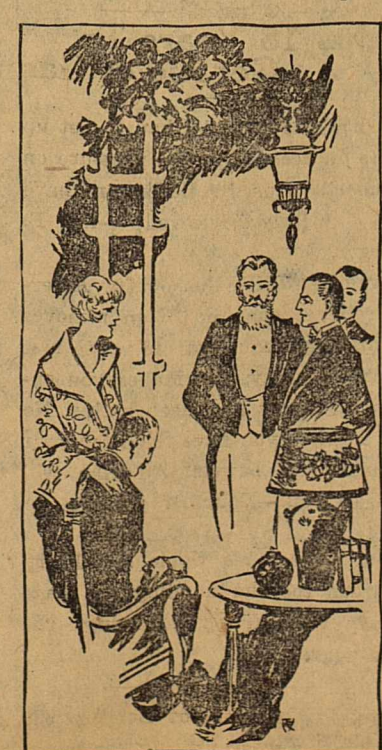
"What Does It All Mean?" the Girl

"I shall go only when you have no further use for me," said Bradney. "When I have done what I prom