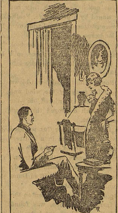
"What Sort of a Comeback?"

"Oh, Nita," he said reproachfully, "that's scarcely playing the game to