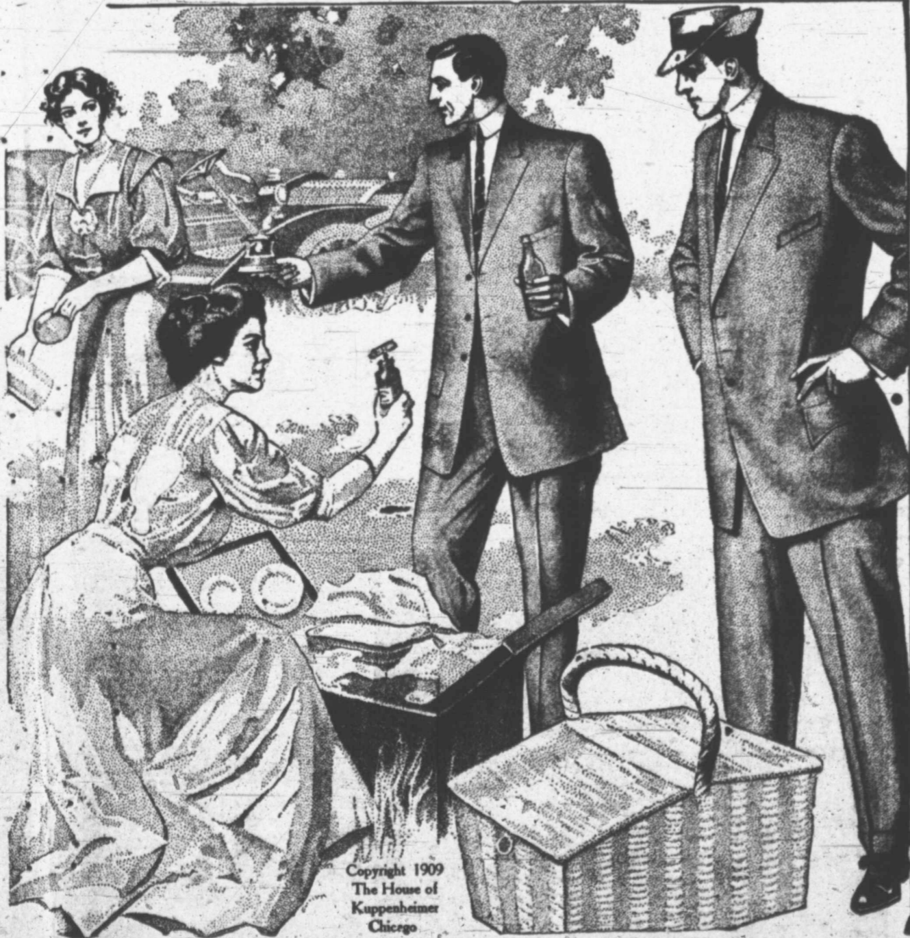
Copyright 1909 The House of Kuppenheimer Chicago

THOSE WHO ARE most particular about the correctness of every detail are quick to recognize the superior style and splendid wearing quality of our KUPPENHEIMER CLOTHES . They combine extreme good taste and durability in a greater degree than any other clothes made. KUPPENHEIMER CLOTHES ARE QUALITY CLOTHES —for men who give a second thought to LOOKS.