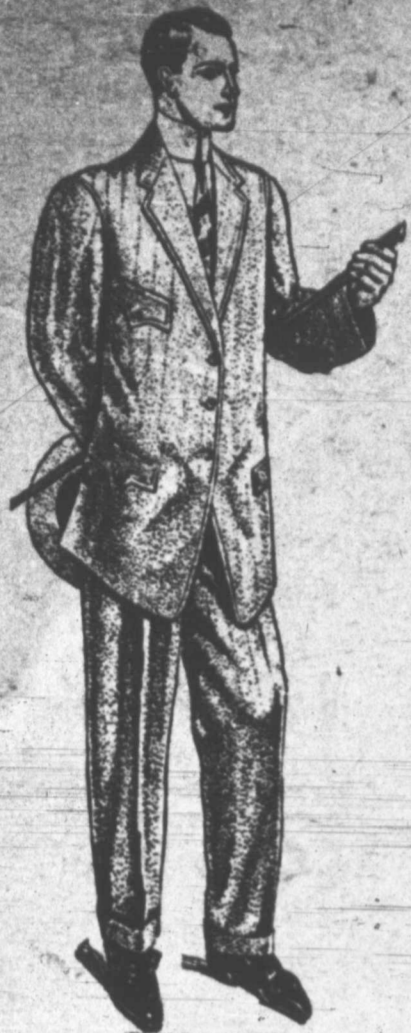
Copyright 1908 by Michaels-Stern & Co. Rochester, N. Y.