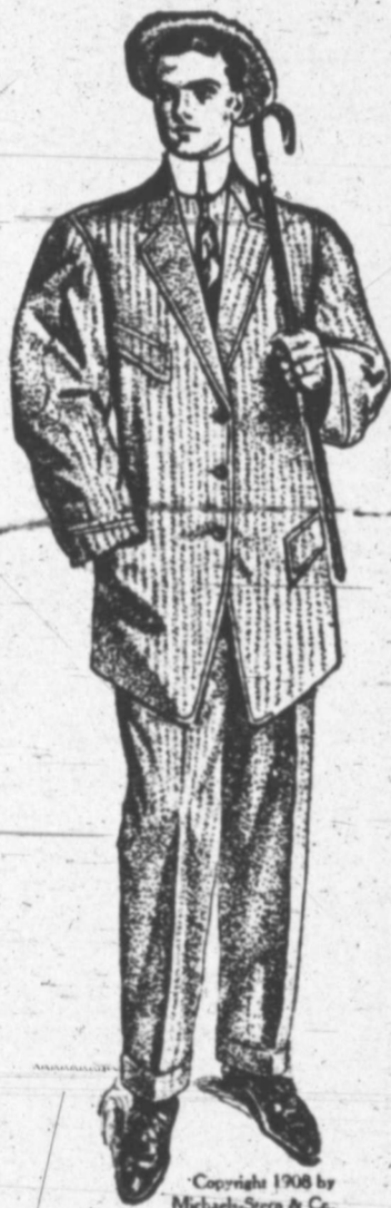
Copyright 1908 by Michaels-Stern & Co. Rochester, N. Y.

In Other Words—We Do Not mark our goods up when they first come in in order to mark them down for Make Believe Bargain Sale.