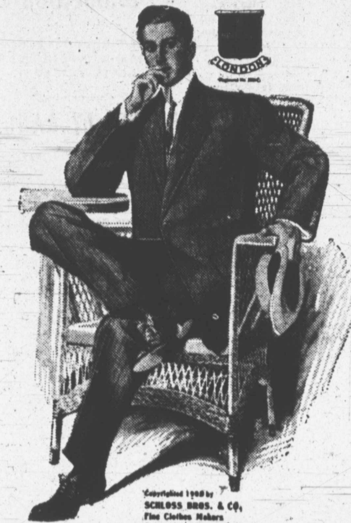
Copyright 1908 by SCHLOSS BROS. & CO., Fine Clothes Makers, Schotters and Hatters, New York.

1 New Spring Suit of Schloss Bros. & Co., Baltimore Make, 1 Shirt with the novelty stripes, 1 pair hose with color, 1 Tie that will mix well—but pronounced effect.