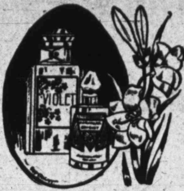
A Dainty Easter Gift

of a bottle of our perfumery or toilet water makes an ideal offering. Especially put up for the season, either will prove more than acceptable to the fair recipient. THERE ARE ALL THE ODORS that fashion has decreed as correct, all the good old scents that the older people still prefer. So you can select a bottle for HER and her mother, as well.