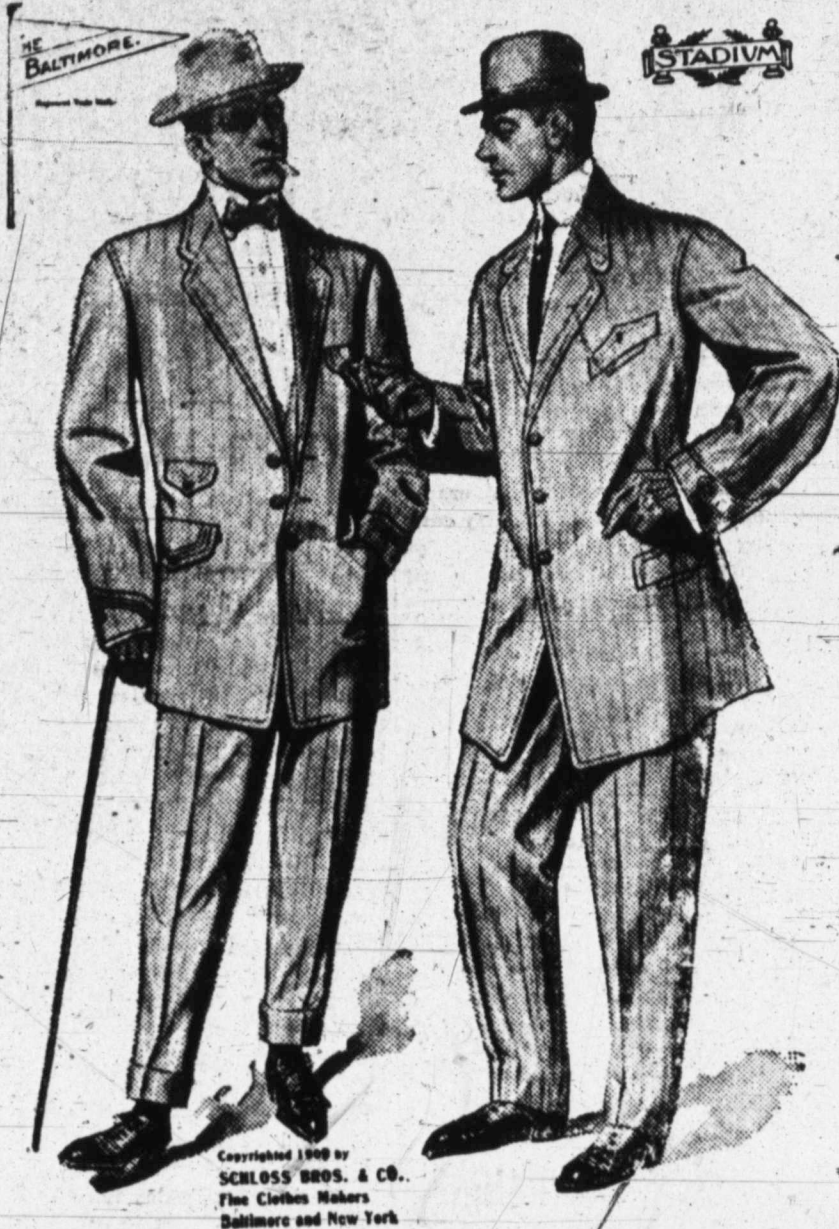
Copyright 1908 by SCHLOSS BROS. & CO. Fine Clothes Makers Baltimore and New York