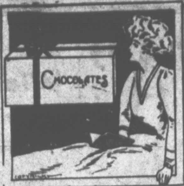
IF SHE ONLY HAD

the imagined box of our fine chocolates to nibble at while reading, she would not mind being storm bound for the entire day. Telephone orders filled for those who desire the service.