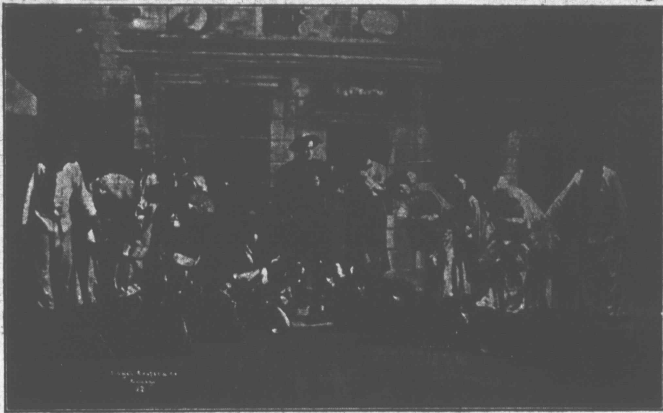
WHAT'S THE USE OF DREAMING--ACT. II

Prices 50c to $1.50--Seat Sale at box office Monday a.m.