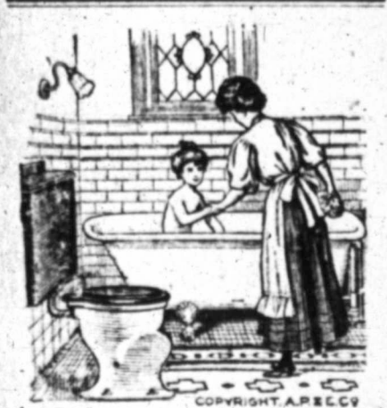
THE MORNING BATH.

Maxwell's Hardware retained our youth! But the heart there.