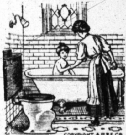
THE MORNING BATH.

with a good hot water supply, is one of life's luxuries that can always be had without expense when you have an up-to-date bath room in your home fitted up with sanitary plumbing, closet, foot tub, bath tub and shower, by