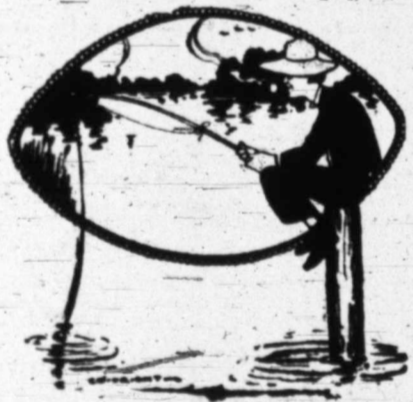
PATIENCE ON A MONUMENT

Have your collars laundered at Pond's Laundry. It has just installed a new machine for that kind of work.