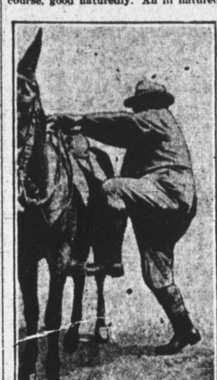
THE SECRETARY OF WAR AND THE ARMY MULE.

his sincere purpose was to help the people of those islands. When he was governor of the archipelago some American residents complained of certain rulings made by him. Taft replied: "These islands are being governed for the benefit of the natives. If you don't like the government you can get out." And he said it firmly, though, of course, good naturedly. An ill natured