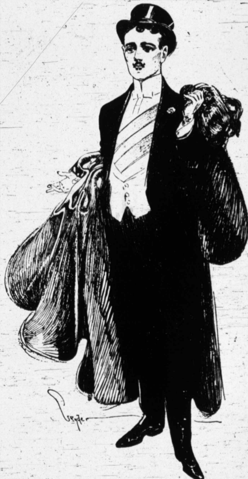
THE LATE ARRIVAL WAS PRINCE DANILU.

Nish was assuring the prince. "Are you quite in condition to see him, if I may?" "Oh, I'm all right enough," yawned Danilo, "only I forgot to go to bed last night. If I could reel off a few yards of sleep—" "Perhaps I could find you some place to—" "I'd prefer a desk, if you can find one. I always sleep best at my desk. But I suppose—" "There is a couch, sir, over in the corner behind the palms. How would that do? You could get a nice nap there, and in a little while I'd find his excellency for you. But, sir, if I may say so, why do you waste your life in dissipation when you might marry and settle down? Just think, now! Would not a dear little wife and a home of your own be better worth while than all your clubs? I leave it to you!" "You leave it to me?" retorted Danilo. "Then I make it clubs." "But, if I may say so—" "You may not," interrupted Danilo, crossing to the couch and throwing himself at full length among its cushions. "By by! If you're waking, call me early!" He spread a handkerchief over his face and in a moment was sound asleep, leaving Nish to tiptoe out in search of Popoff. For a few minutes no sound was audible in the empty salon save the distant swell and fall of dance music, punctuated by the slumberous prince's heavy breathing.