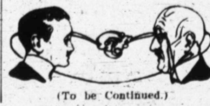
(To be Continued.)