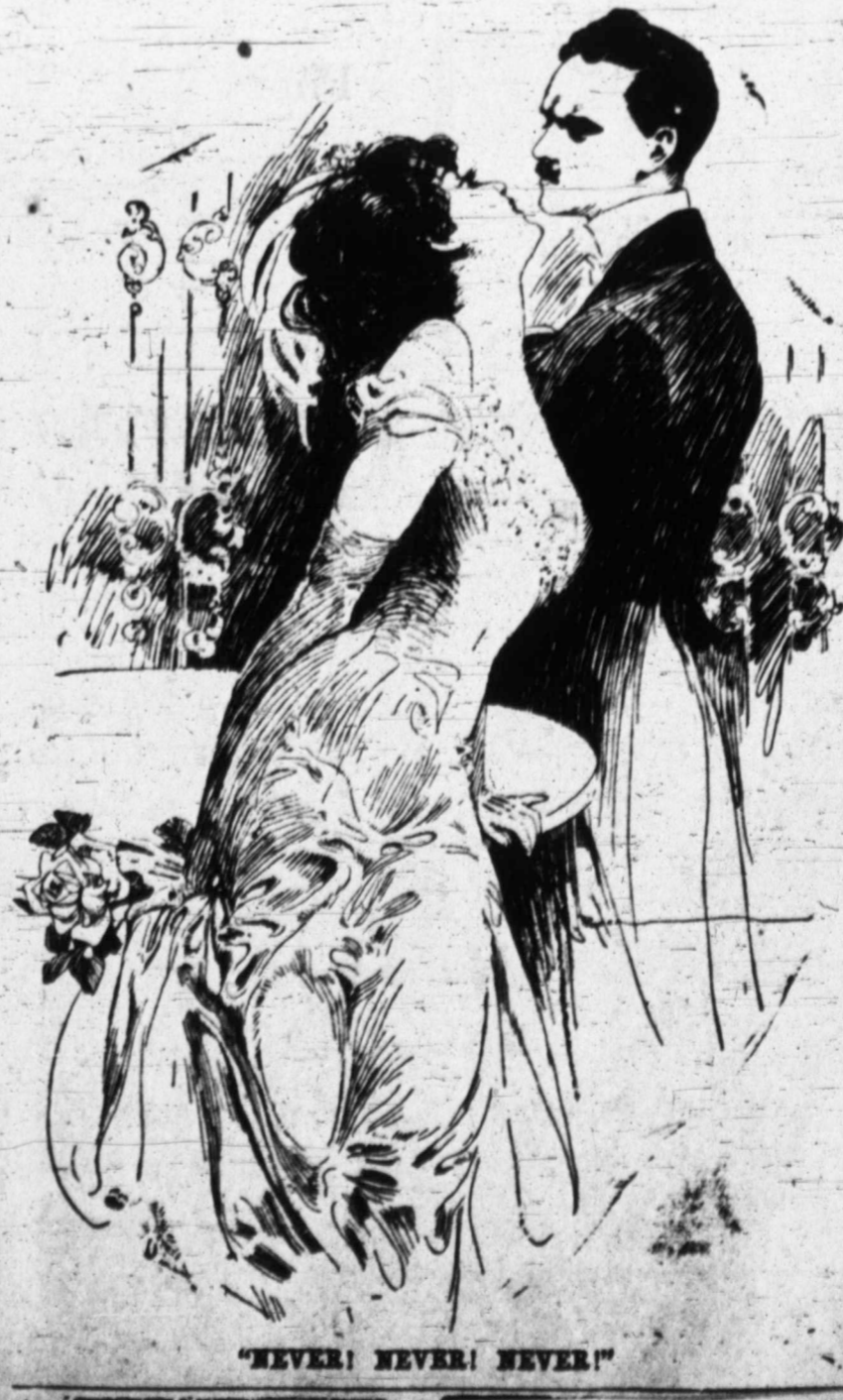
"NEVER! NEVER! NEVER!"