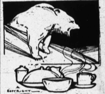
AS HUNGRY AS A BEAR

Lepanders are the shortest people in Europe, the men averaging 4 feet 11 inches, the women 3 feet 9 inches.