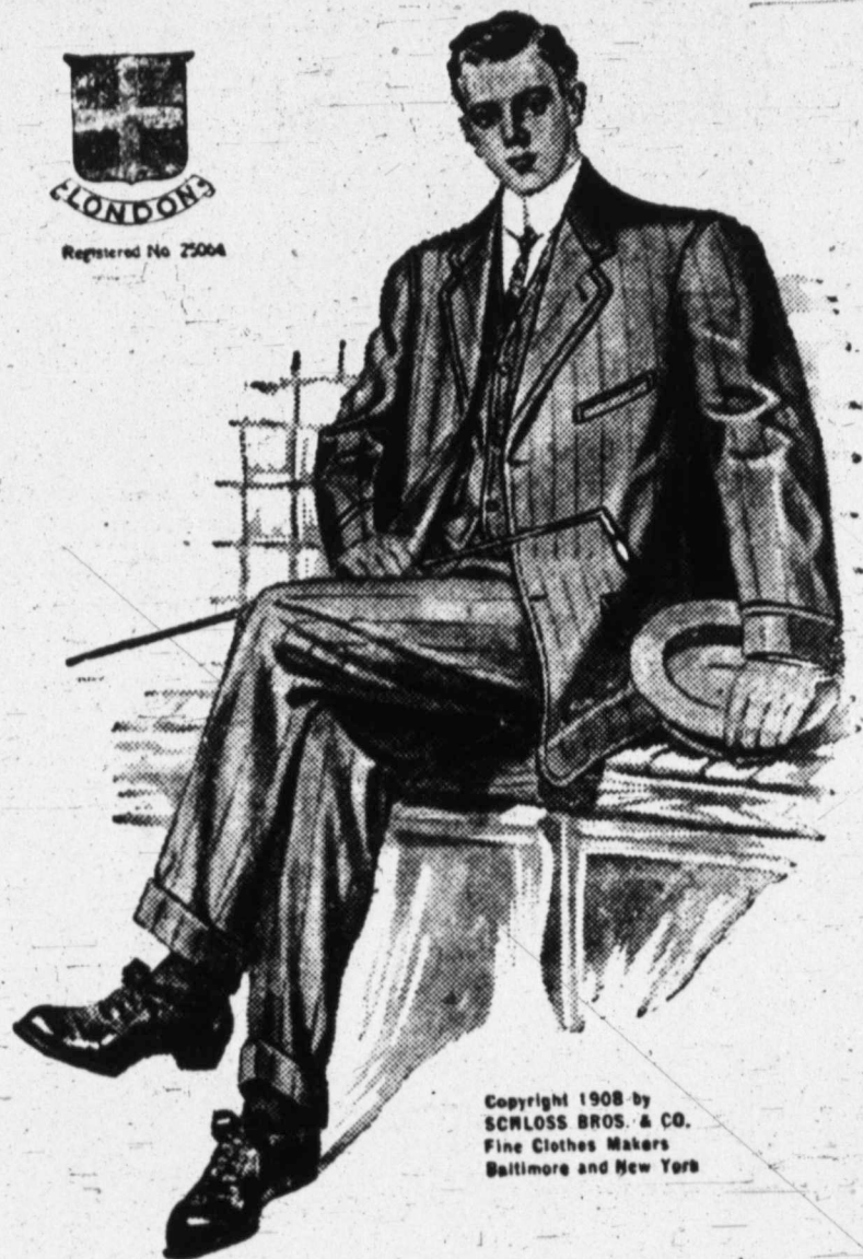
Copyright 1908 by SCHLOSS BROS. & CO. Fine Clothes Makers Baltimore and New York