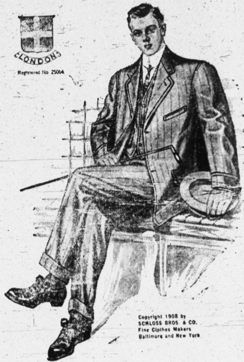
Copyright 1908 by SCHLOSS BROS. & CO. Fine Clothes Makers Baltimore and New York