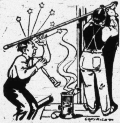
A. L. TOMPKINS, The Plumber.

In the danger of permitting poor plumbing is bound to come sooner or later. The toilet gets out of order, taps leak, water pipes seep at the connections, the sewer gets choked up—a hundred and one things happen which ought not to, and would not happen if your plumbing was perfect. Send for us when you want a good plumber. Our work is guaranteed.