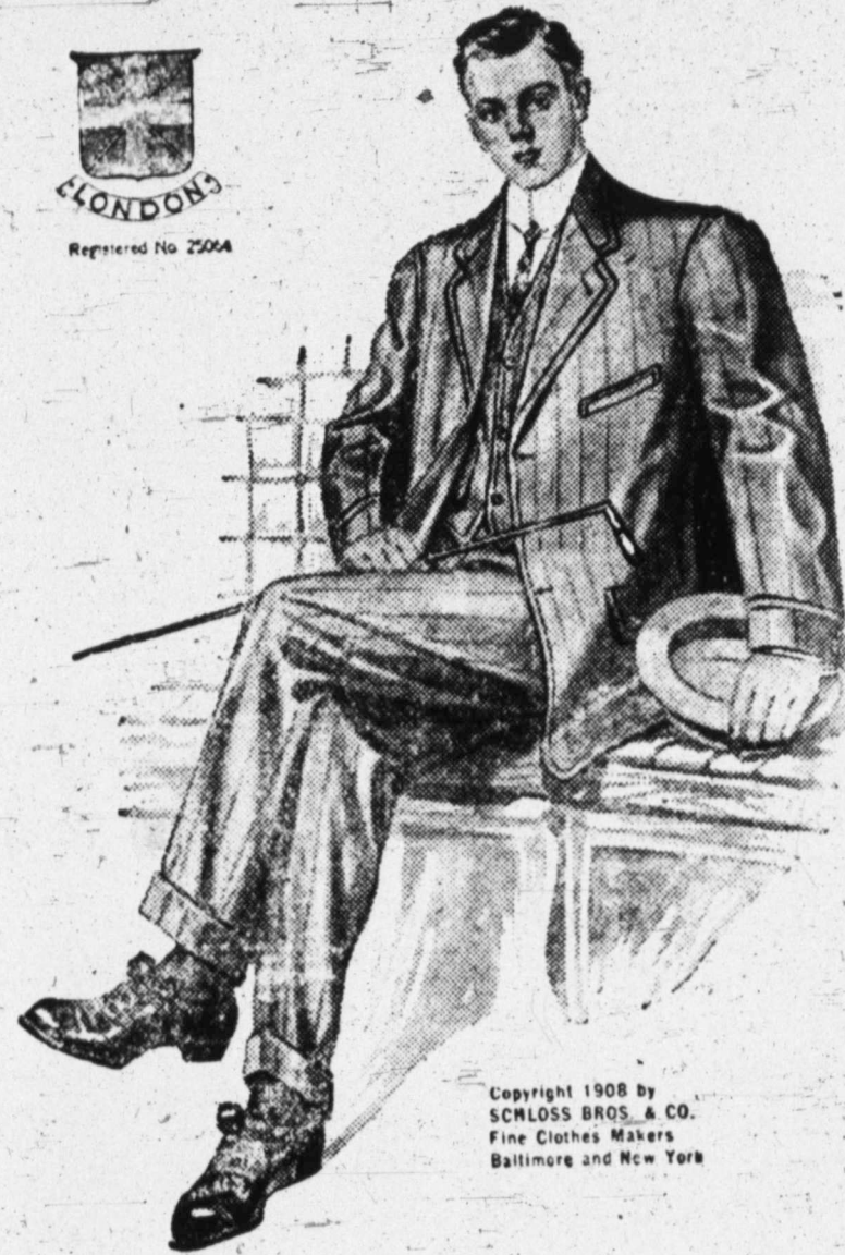
Copyright 1908 by SCHLOSS BROS. & CO. Fine Clothes Makers Baltimore and New York