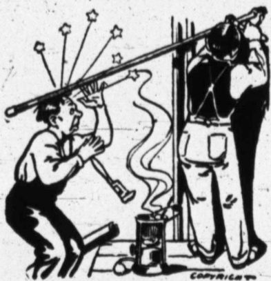
A. L. TOMPKINS, The Plumber.

In the danger of permitting poor plumbing is bound to come sooner or later. The toilet gets out of order, taps leak, water pipes seep at the connections, the sewer gets choked up--a hundred and one things happen which ought not to, and would not happen if your plumbing was perfect. Send for us when you want a good plumber. Our work is guaranteed.