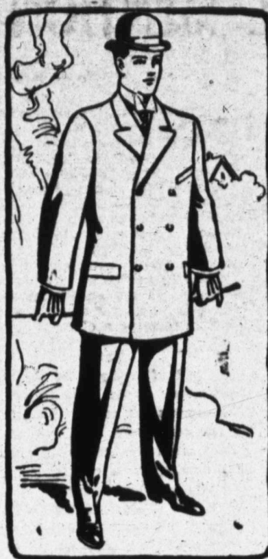
SUITS ORDERED TODAY DELIVERED TOMORROW.