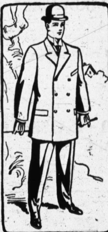
SUITS ORDERED TODAY DELIVERED TOMORROW.