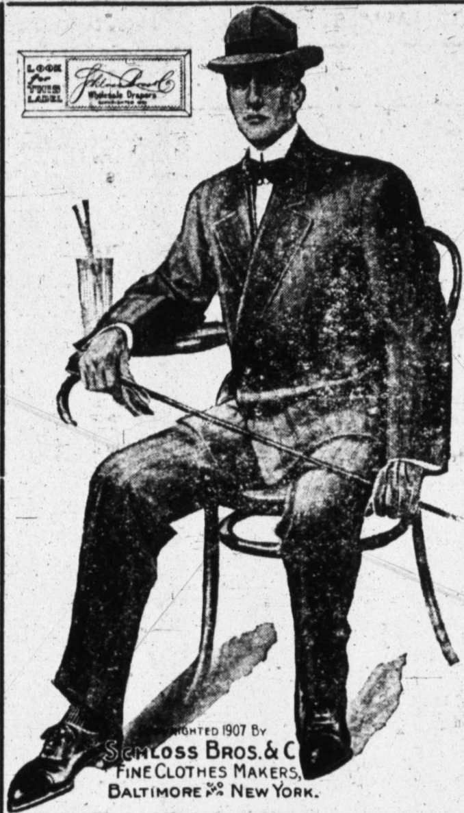
REGISTERED 1907 BY SCHLOSS BROS. & CO. FINE CLOTHES MAKERS, BALTIMORE & NEW YORK.