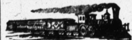
"The Wichita Falls Route"

The Wichita Falls & Northwestern Ry System