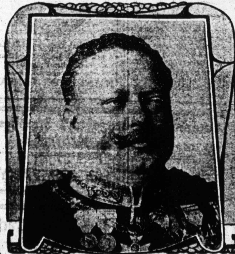
THE LATE KING CARLOS.

The Crown-Prince Luis Philippe, duke of Braganza, was only twenty years of age, and little was known of him except that he was the extreme opposite of his father in disposition, and this caused frequent trouble between them. When the political opponents of his father's government told