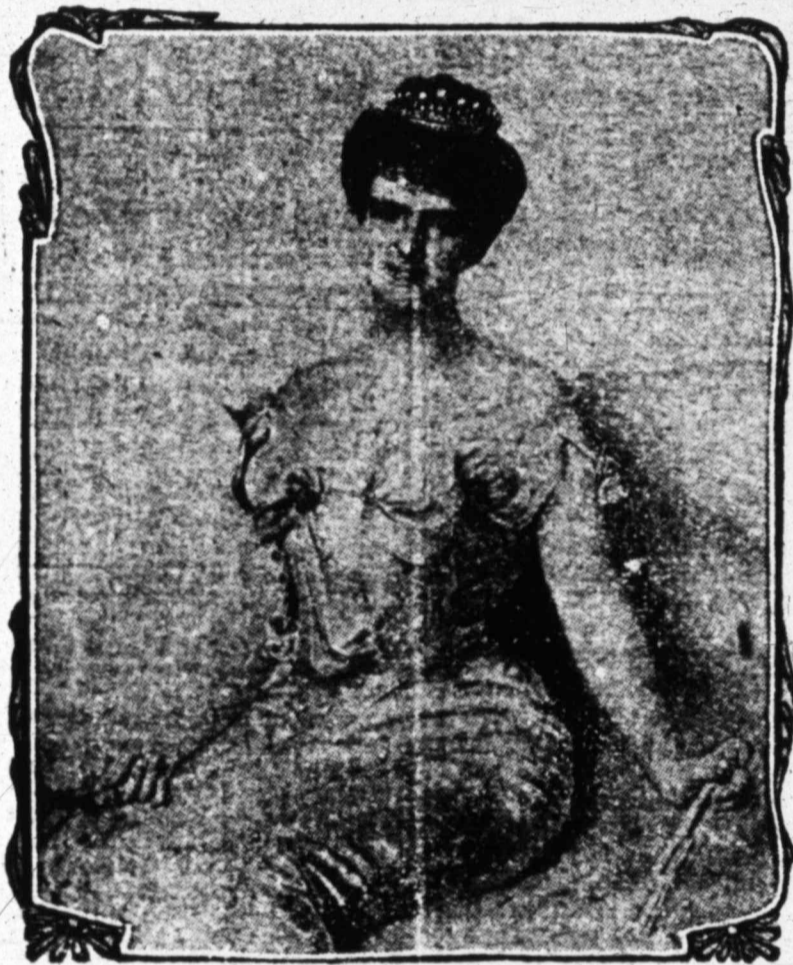
QUEEN AMELIE OF PORTUGAL.