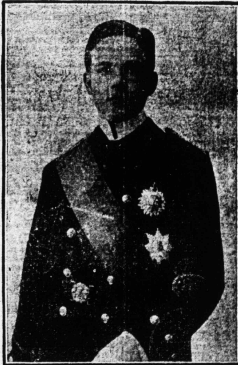
KING MANUEL II. OF PORTUGAL.

The Republicans declared that King Carlos had done more to deserve death than Louis XVI. of France. Rioting continued at various points in Portu-