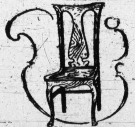
All Quartered with Cobbler Seat.