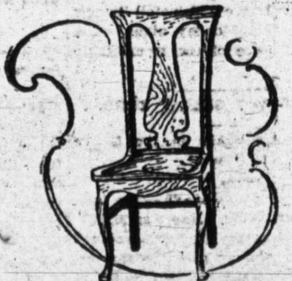
All Quartered with Cobbler Seat.