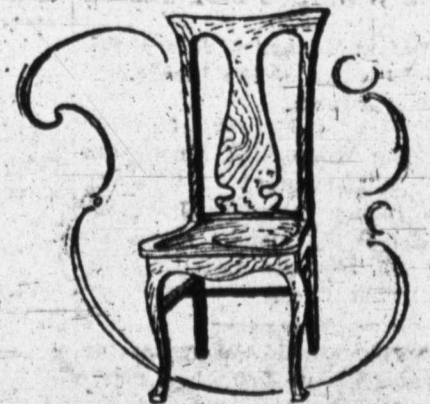
All Quartered with Cobbler Seat.