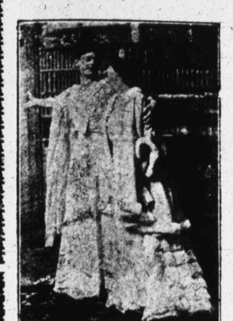
Scene From Act Two