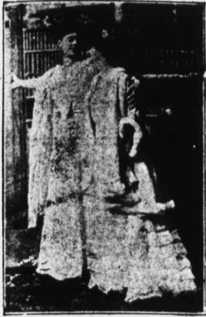
Scene From Act Two

Played 287 Times to 281,211 paid admissions at the Criterion Theatre, N. Y. City.